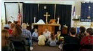
Christmas Eve, 2012