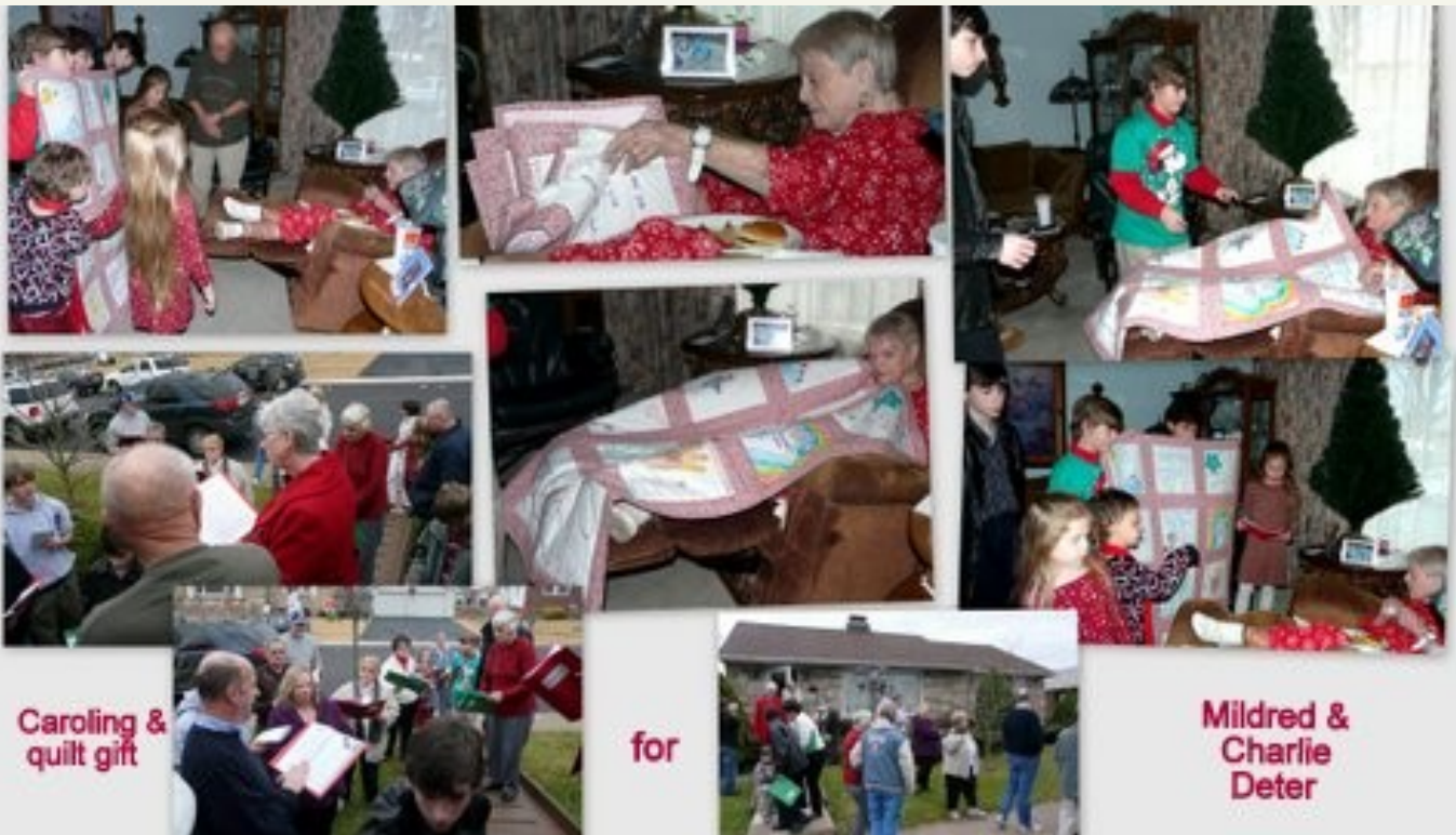
Caroling & quilt gift