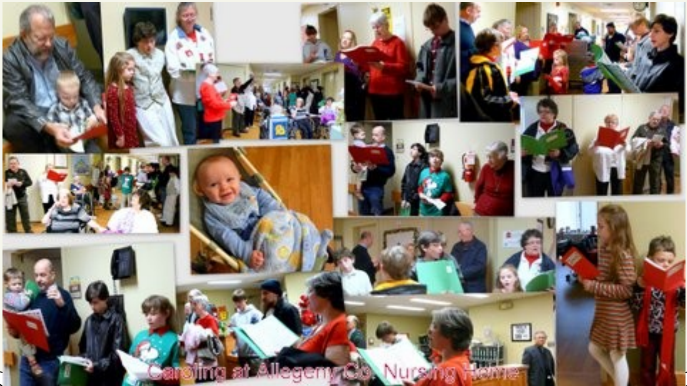
Caroling at Allegany Co. Nursing Home